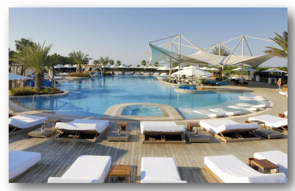
The Regnum Golf & Spa Resort in Turkey, really understands their guest pain points. 1.2 sun loungers per person, enough parasols for every two guests and as many towels as you want! Joy!

most hotels (even many of the top hotels) just ignore and in doing so they bring a world of pain to their guests and to themselves on a regular basis.