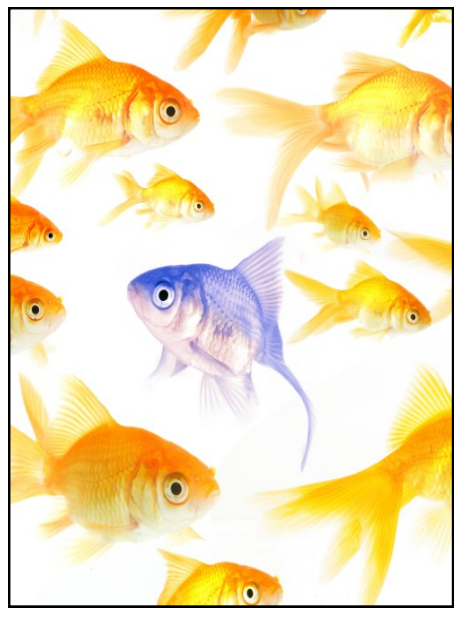
Differentiating your business from the competition is one of the most important Core Elements!

Your differentiator can often be found in your business – you just need to